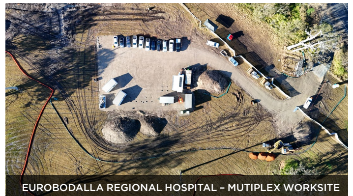
EUROBODALLA REGIONAL HOSPITAL - MUTIPLEX WORKSITE

If you would like to speak with a member of the project team directly, call our project information line on 1300 391 949 or email us at HI-EurobodallaHospital@health.nsw.gov.au .