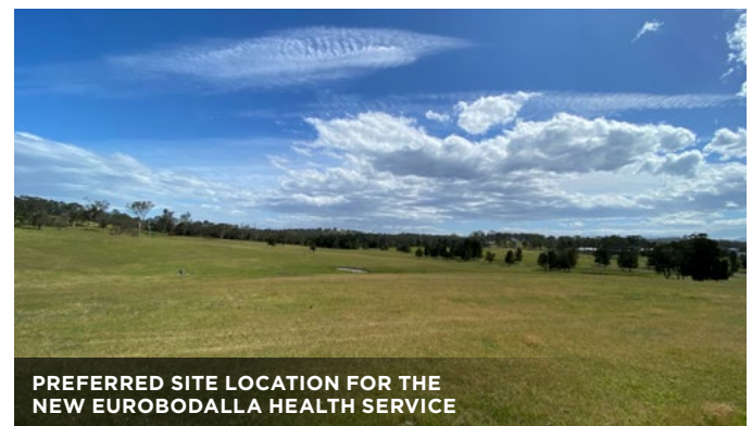
PREFERRED SITE LOCATION FOR THE NEW EUROBODALLA HEALTH SERVICE